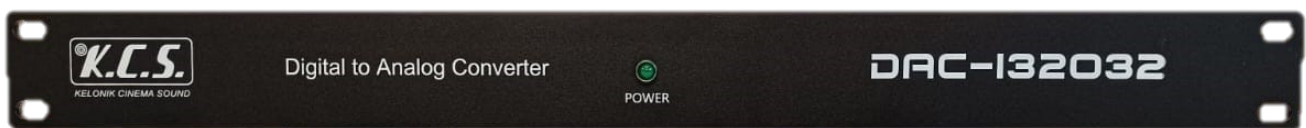
Front panel of KCS DAC-I32O32