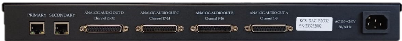
Rear panel of KCS DAC-I32O32