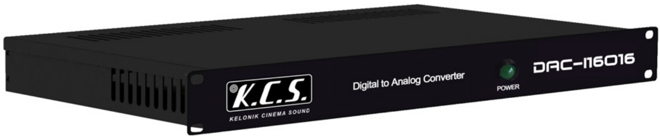
Front panel of KCS DAC-I16O16